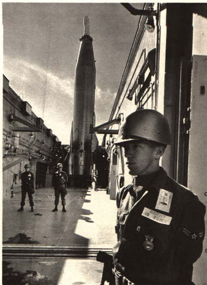
One of Forbes' Atlas Missiles stands ready on the launching pad. The ICBM's are assigned to the 548th Strategic Missile Squadron.

The re-entry vehicle is made by General Electric Company, Missile and Space Vehicle Department, Philadelphia, Pennsylvania.