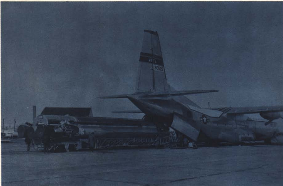
A MATS C-133 Cargomaster unloads an Atlas ICBM at Forbes AFB

During June 1944 combat activities of the squadron were concerned exclusively with tactical targets along the northern coast of France, first as a means of helping